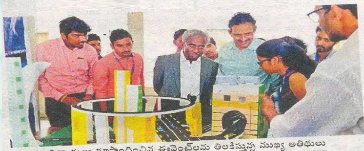
విద్యార్థులు రూపొందించిన ఈవెంట్లను తిలకిస్తున్న ముఖ్య అతిథులు

సివిల్ ఇంజనీర్లు నిర్మాణ రంగంలో రాణించాలి