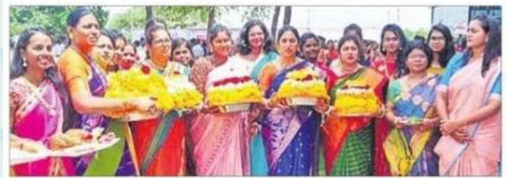
దుండిగల్ ఎంఎల్ఆర్ఐఎటీఎం కళాశాలలో బతుకమ్మ వేడుకలు