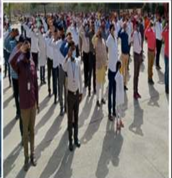
Republic day Celebrations-2022