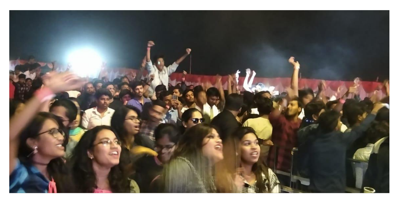
A NIGHT TO REMEMBER FOREVER