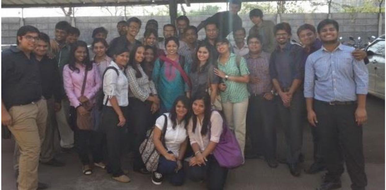
Photo Graphs of Student Presents in the Industry Expectations from New Age Engineers