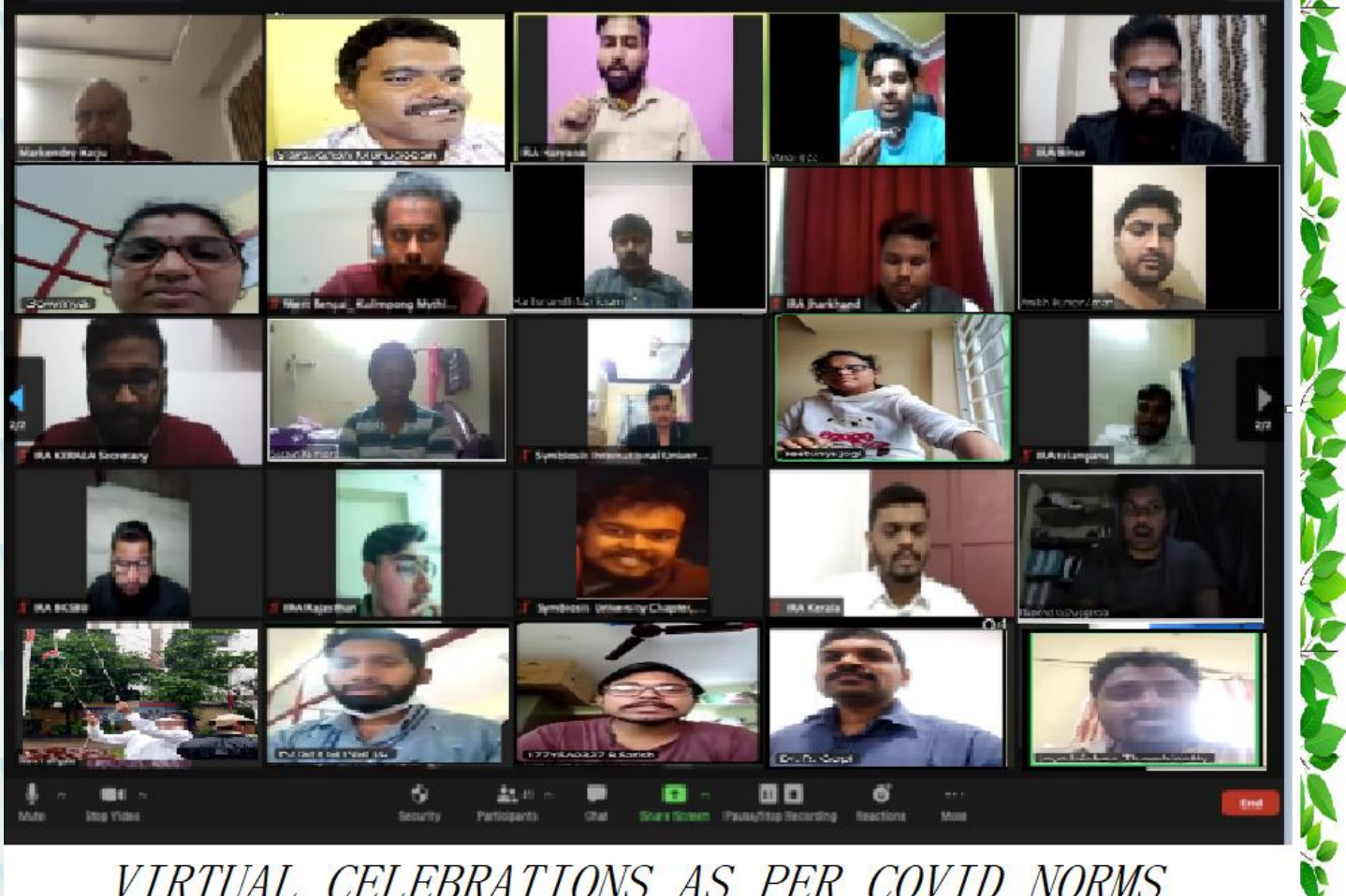
VIRTUAL CELEBRATIONS AS PER COVID NORMS