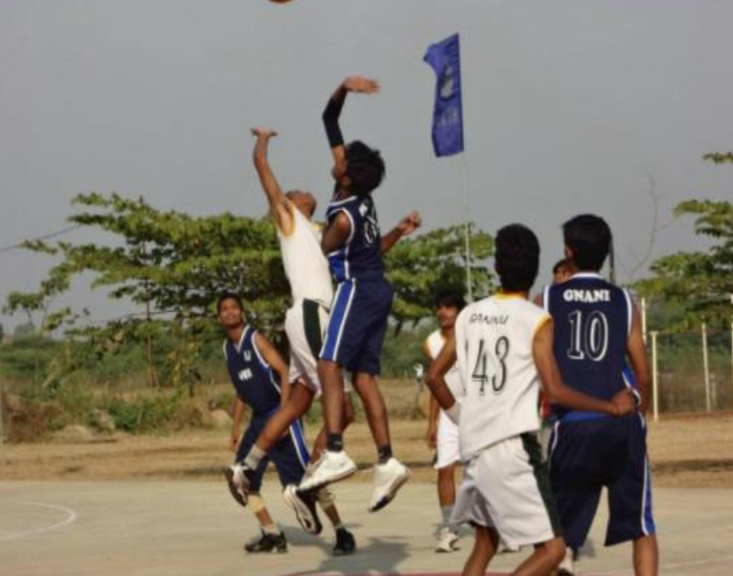
Students from Final year Civil have stood in first place in volley ball completion organized by physical education on the occasion of sports meet 2019