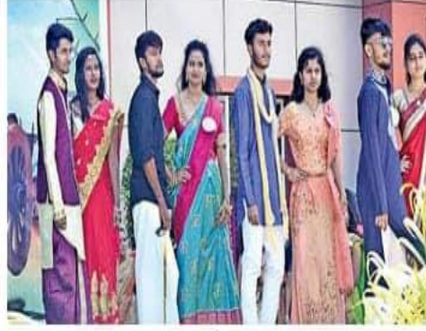
దుండిగల్లోని ఎంఎల్ఆర్ఎఫ్ఎం కళాశాలలో నిర్వహించిన సంప్రదాయ దినోత్సవంలో విద్యార్థుల ర్యాంప్ వాక్

కళాశాలలో సంప్రదాయ దినోత్సవం నిర్వహించారు. సంప్రదాయ దుస్తుల్లో విద్యార్థులు సందడి చేశారు. బోనాలు, బతుకమ్మ పండగలతో పాటు దాండియా, రేలా నృత్యాలు ప్రత్యేక ఆకర్షణగా నిలిచాయి. ఎండ్ బండ్లపై ఊరేగింపు, డోలు, బ్యాండ్లతో పాటు జానపద నృత్యాలతో అలరించారు. ర్యాంప్ వాక్, డీజేకు అనుగుణంగా ఆదిరేటి స్టెప్పులతో ఆదరగొట్టారు.