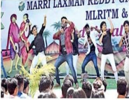
విద్యార్థుల సాంస్కృతిక ప్రదర్శన

కళాశాలలో సంప్రదాయ దినోత్సవం నిర్వహించారు. సంప్రదాయ దుస్తుల్లో విద్యార్థులు సందడి చేశారు. బోనాలు, బతుకమ్మ పండగలతో పాటు దాండియా, రేలా నృత్యాలు ప్రత్యేక ఆకర్షణగా నిలిచాయి. ఎండ్ బండ్లపై ఊరేగింపు, డోలు, బ్యాండ్లతో పాటు జానపద నృత్యాలతో అలరించారు. ర్యాంప్ వాక్, డీజేకు అనుగుణంగా ఆదిరేటి స్టెప్పులతో ఆదరగొట్టారు.