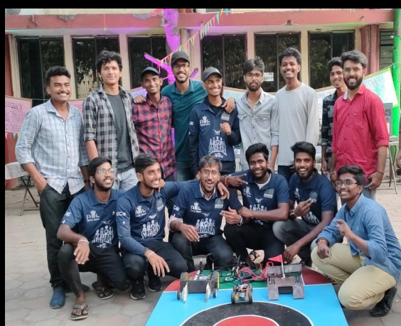
Students participating in Tech Fest