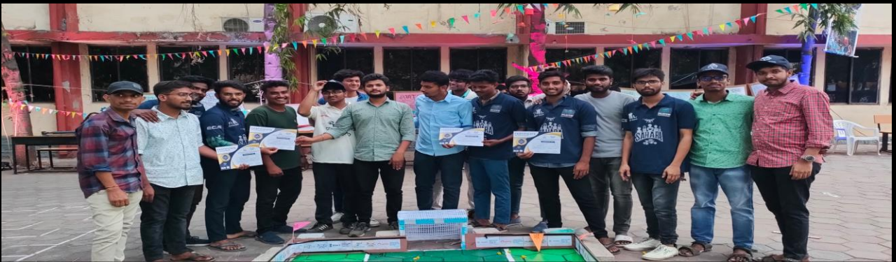
Students participating in Tech Feast