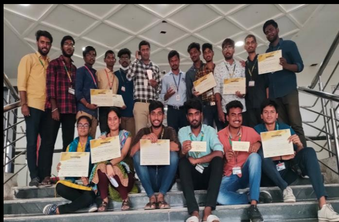
Students participating in Tech Feast